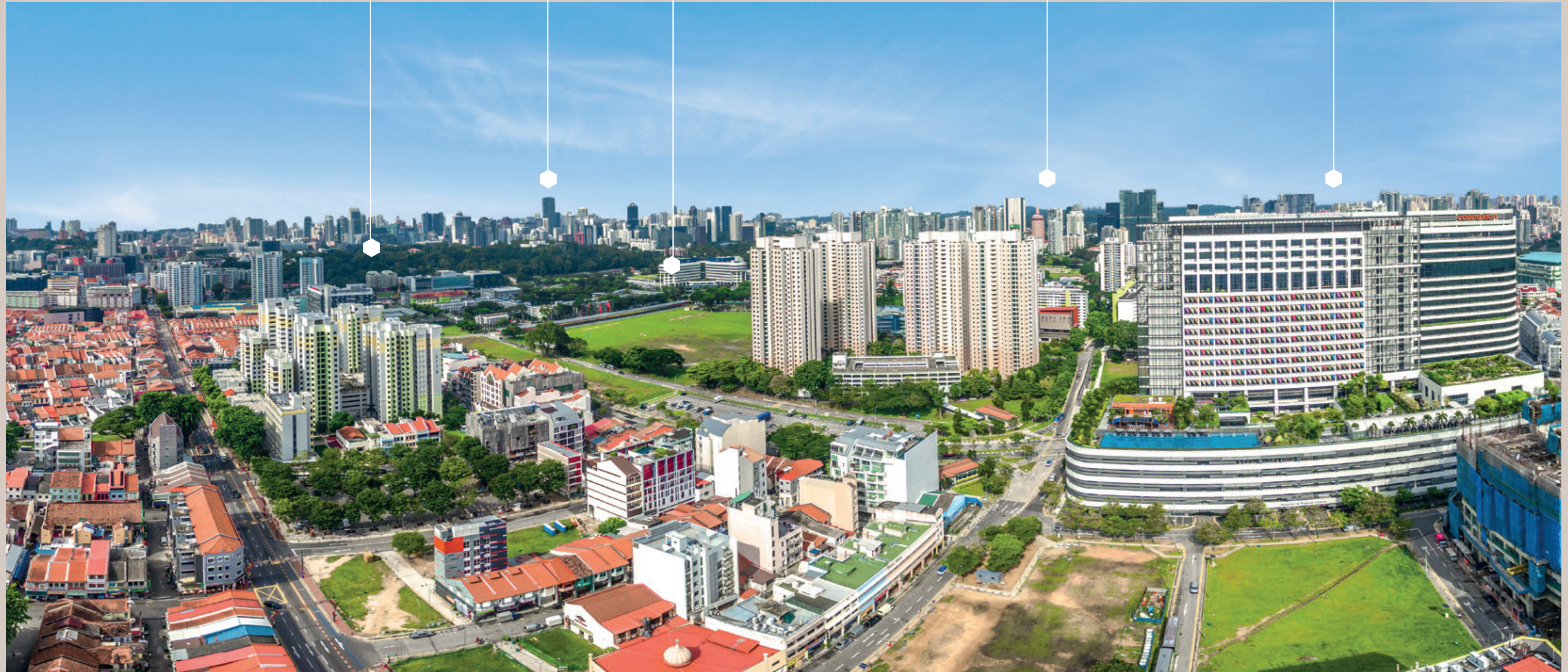
Actual View From West Facing