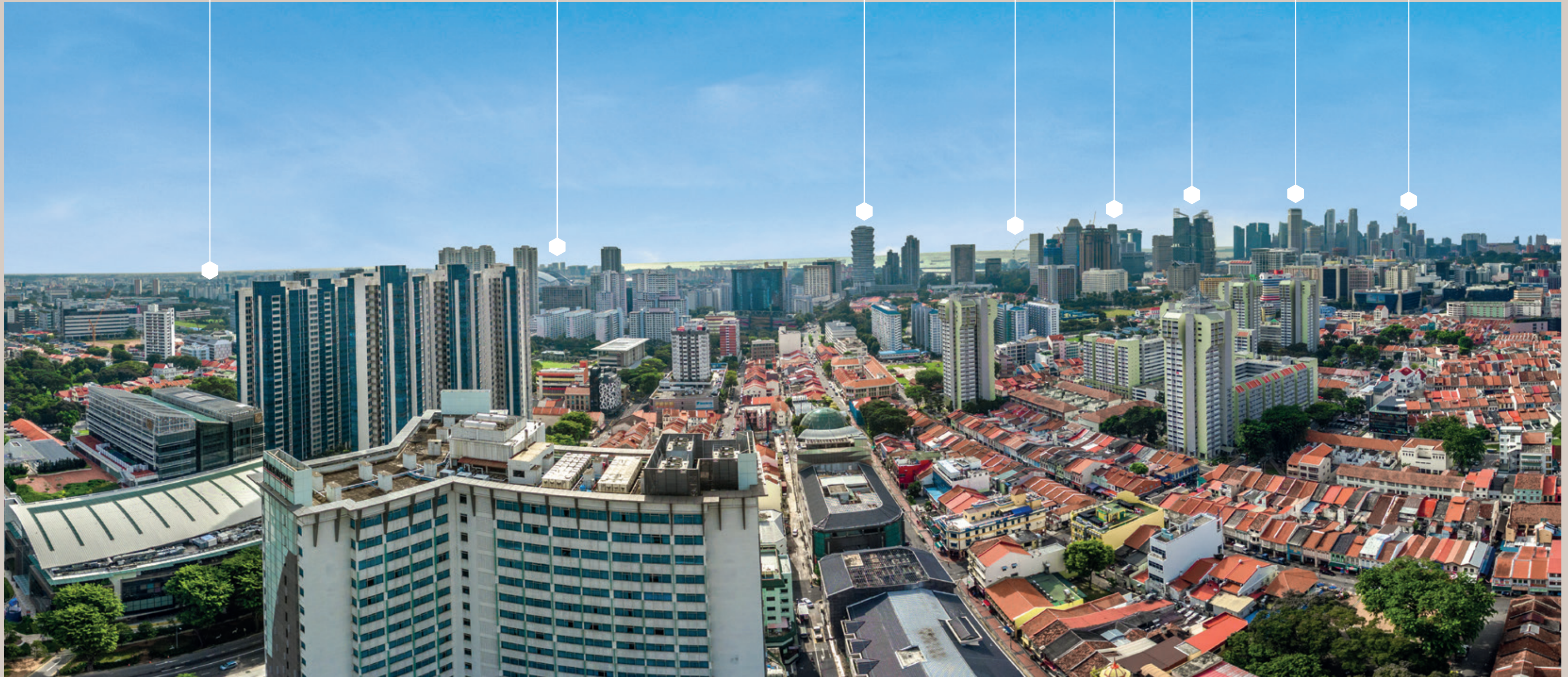
Actual View from South Facing